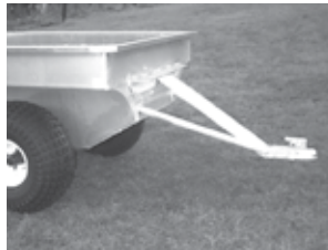
GOOSENECK BEVELED TUB

TIRE UPGRADES AVAILABLE; 4 PLY, 6 PLY, UP TO 25X13.5X9